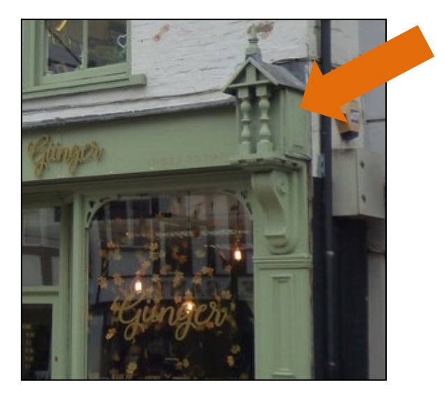
Giinger, Hair Salon, Worcester Road

3.10 The proposed name of the meanwhile use concept is Bird Box . The reason for this name is multi-faceted but the origins reflect some of the key architectural features that exist on many of the buildings in the surrounding area (please see below)